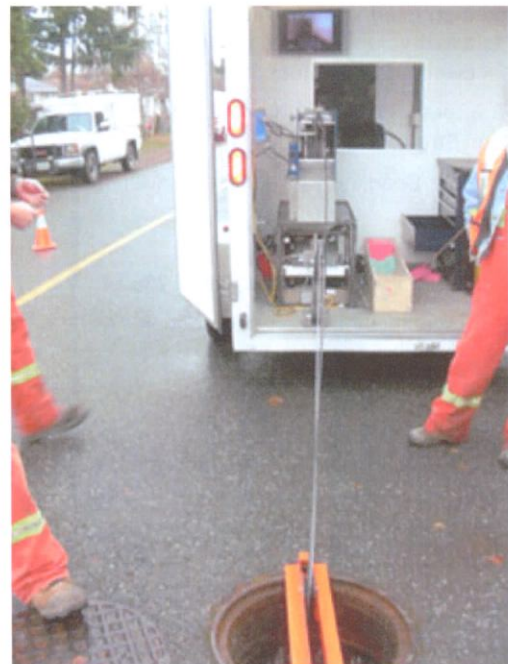
CCTV Video of Sanitary Sewer Pipes