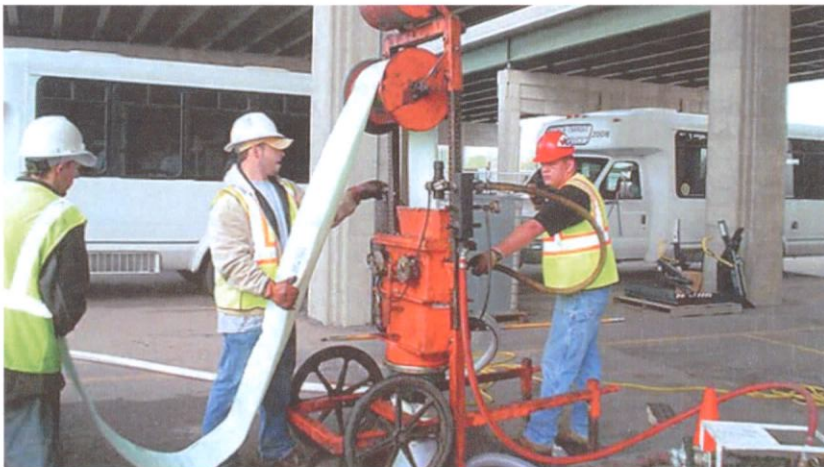
Cure In Place Pipe lining of Sanitary Sewer Mains