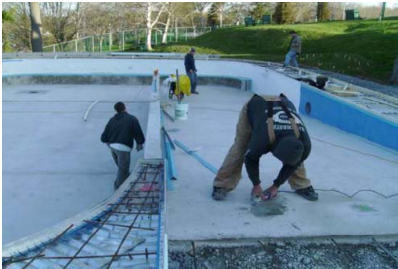
Sample Picture Showing Zero Depth Entry System