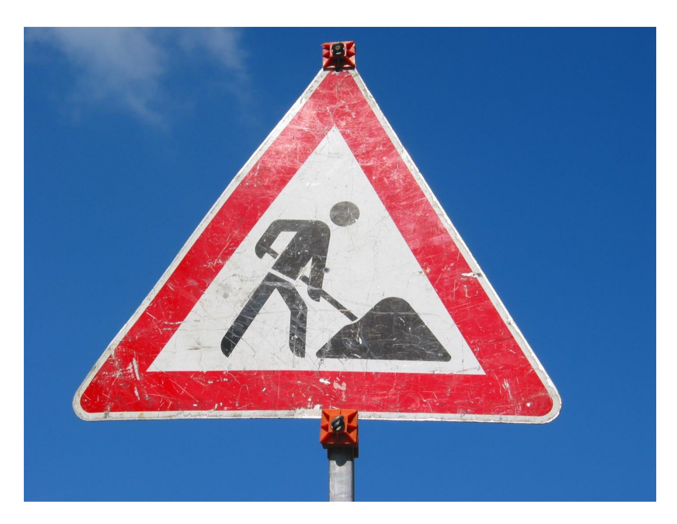
Sustainability Plan: Implementation

The success of the Mayerthorpe Sustainability Plan is contingent on several factors in the community. These factors include: community buy-in into the vision proposed by the plan, the integration of sustainability into the decision-making processes of the Town of Mayerthorpe, and funding as assigned by Town Council and contributions from community. The proposed MSP implementation framework is outlined on the following page.