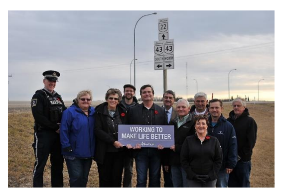
Highway 43 Traffic Light Announcement