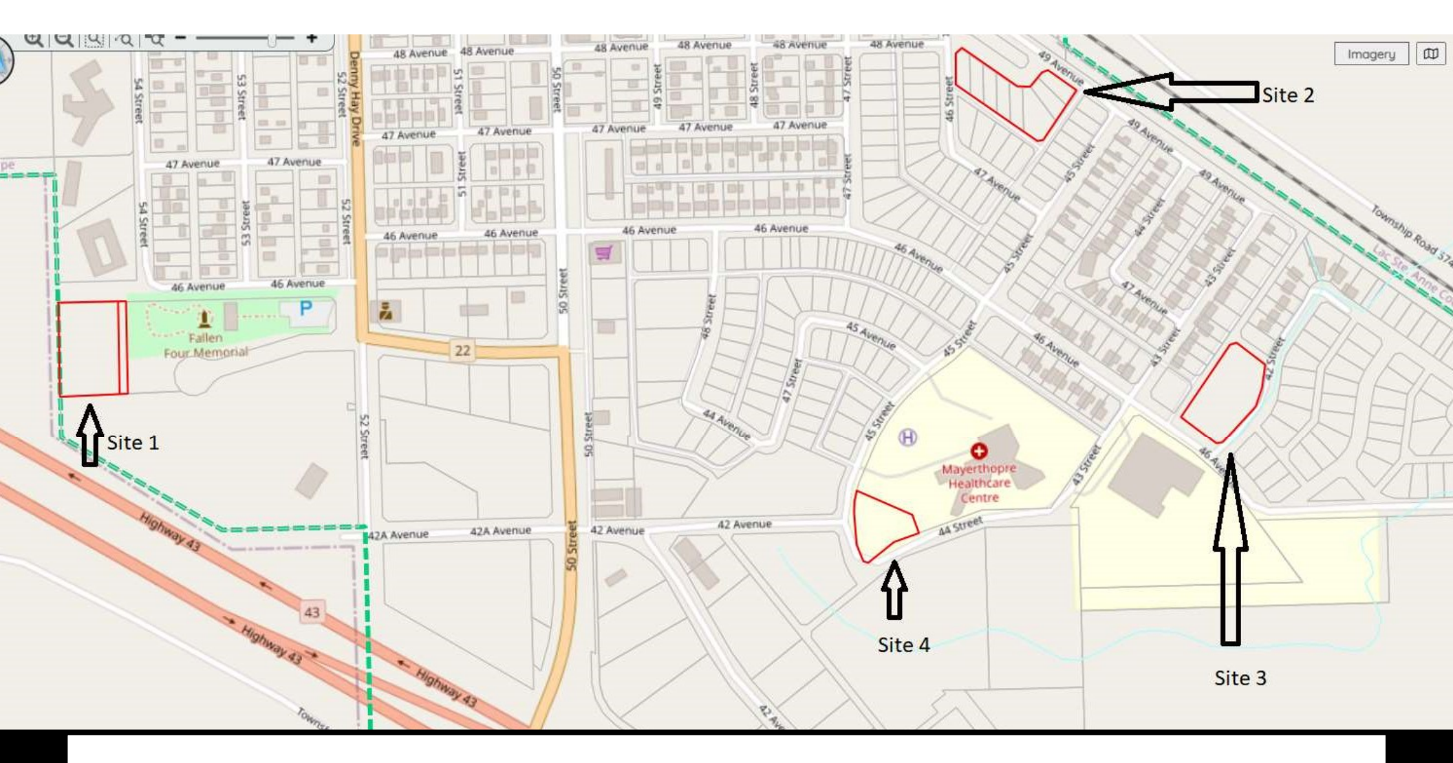
Fully Serviced Lots Ready for Residential Development